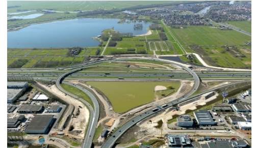
A9 Gaasperdammerweg Amsterdam, Netherlands