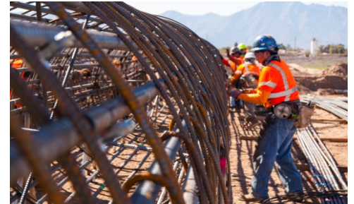
Loop 202 South Mountain Freeway Phoenix, Arizona