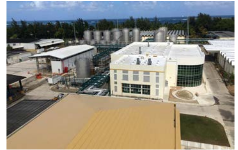
Bacardi Spirit Manufacturing Facility Catano, Puerto Rico