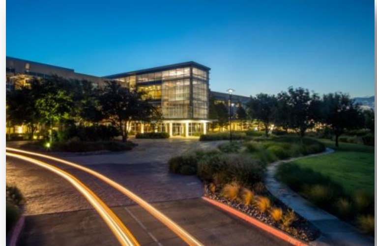
Fluor Corporate Headquarters Dallas, Texas