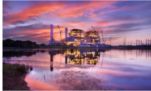
Oak Grove Generating Station Oak Grove, Texas