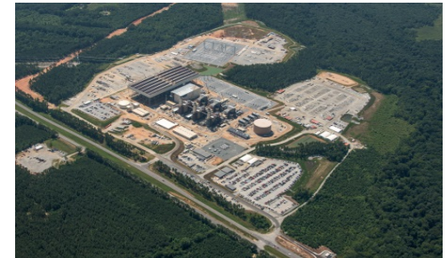
Brunswick County Power Station Freeman, Virginia