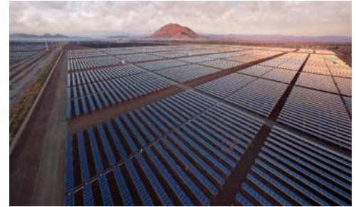
Centinela Solar Energy Calexico, California