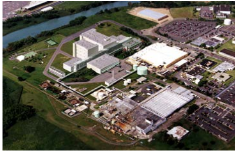
Lilly del Caribe Humalog Biotech Manufacturing Facility Carolina, Puerto Rico