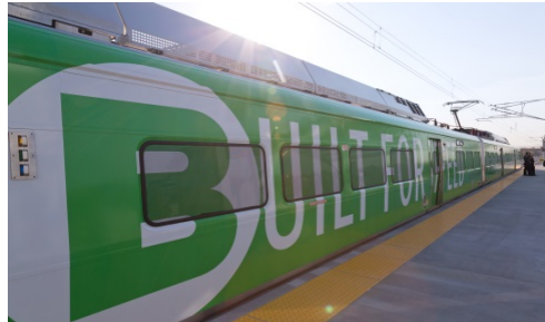
Eagle P3 Commuter Rail Line Denver, Colorado