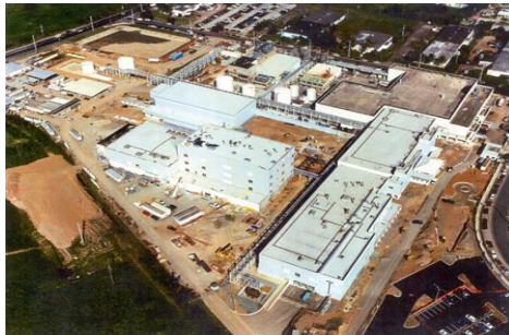
AstraZeneca Pharmaceutical Tablet Facility Canóvanas, Puerto Rico