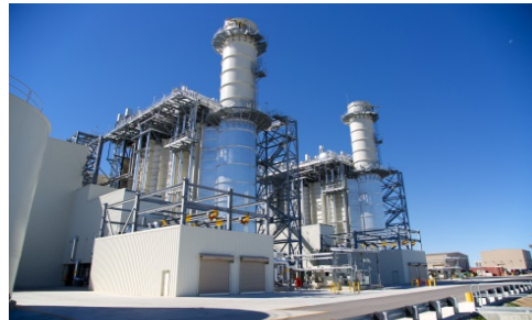
LCRA Gas-Fired Power Plant Horseshoe Bay, Texas