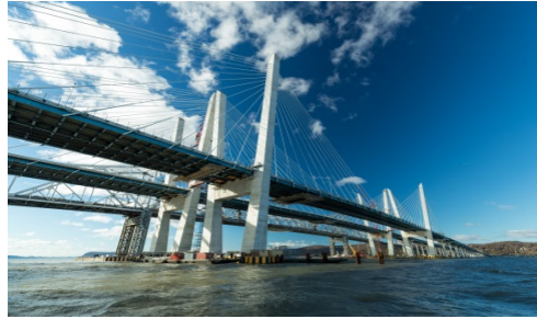
Governor Mario M. Cuomo Bridge New York, New York